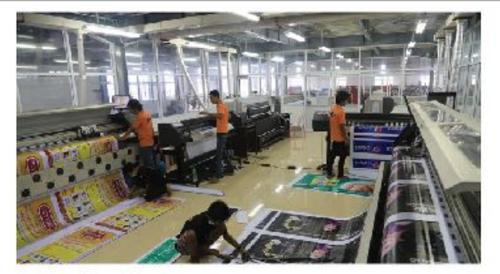
Machine Room 2